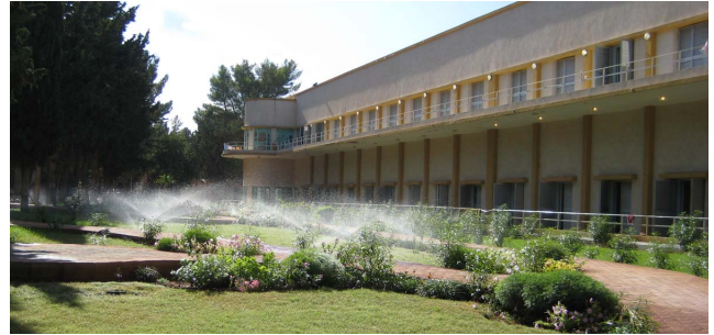
Intensive Care Unit